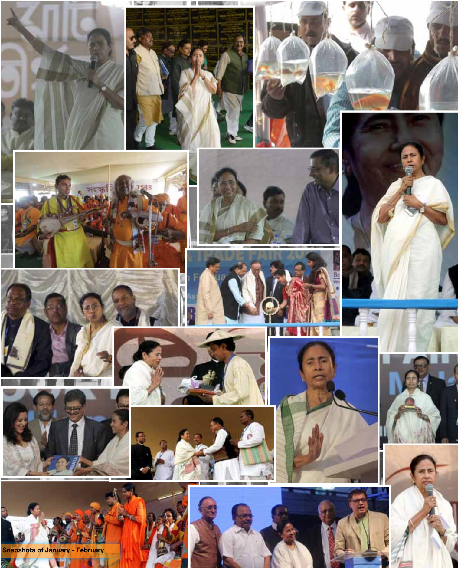
Snapshots of January - February